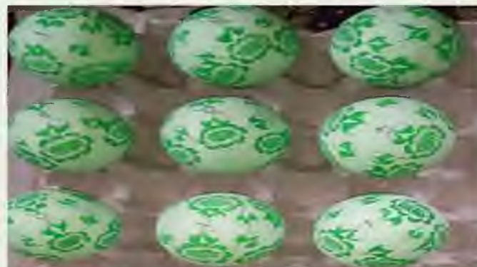
Varnished balls ready for outlines