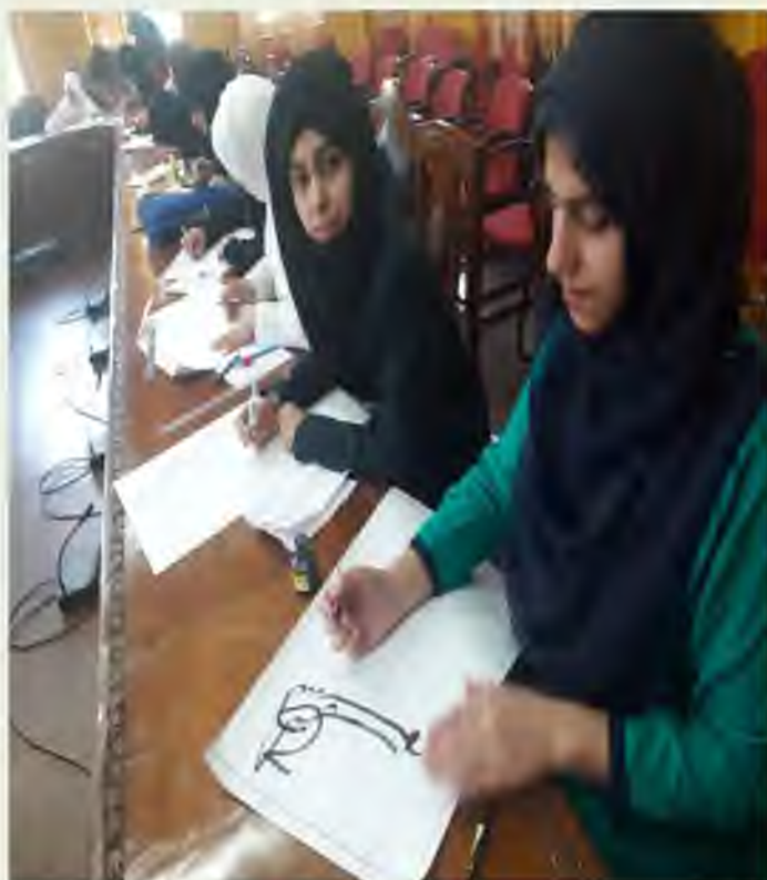
Calligraphy Competition between the students