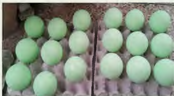
Balls with base color ready to draw designing