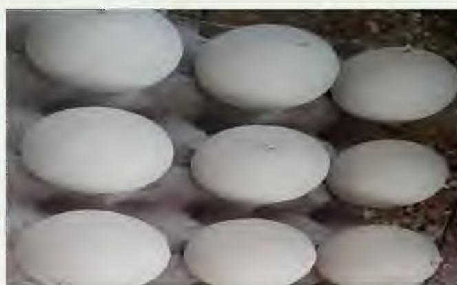
Smoothened balls ready for base colour