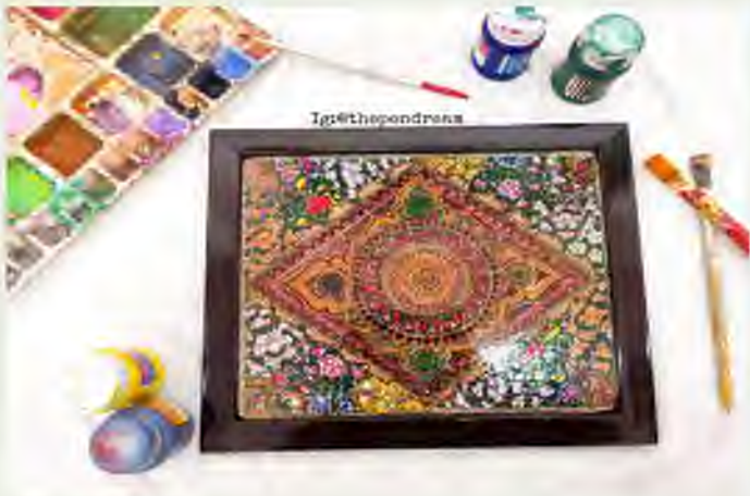
Wall Hanging painting