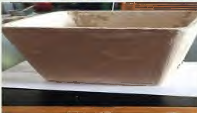
Papier mache fruit bowl coated with gypsum.