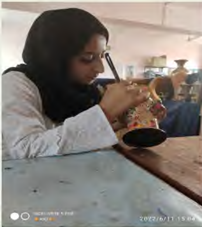
Students of B.Sc 5Th Sem giving shadings to the traditional Samavour.