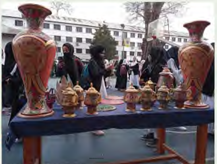
Exhibition of Paper Machie Products.