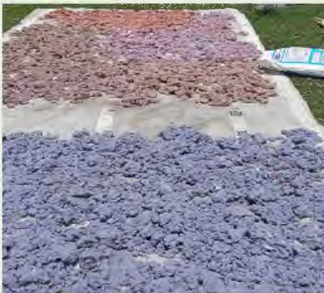
Mashed paper keep to dry up

Photographs of paper pulp objects made by learners