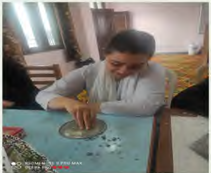
Student making the paper plate with the help of steel moulding