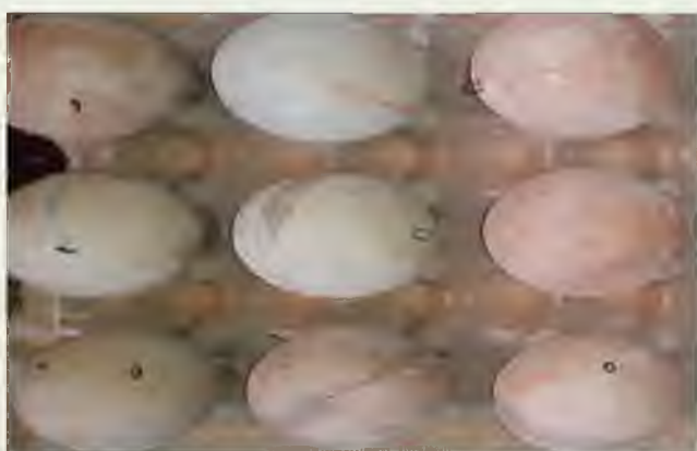
Raw material of paper pulp ready for gypsum coating