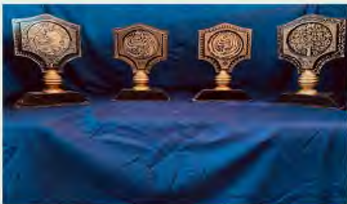
Wooden Momentos with Papier Machie Art