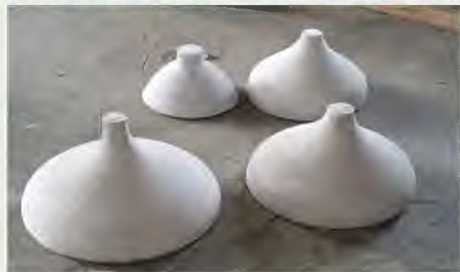
Basic material ready for papier mache process