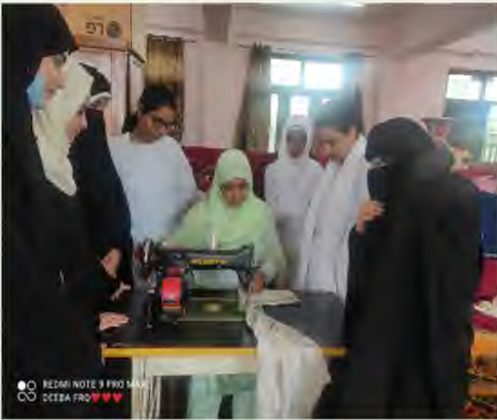
Instructor instructing students how to stitch

The skill cell is accommodated in a spacious hall within the premises of the institute. It has the capacity to accommodate 50 students at a time. The skill cell is equipped with all types of equipments required for training the students in dress designing and paper mache.