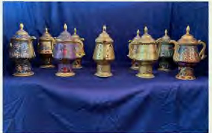
Samavours on display