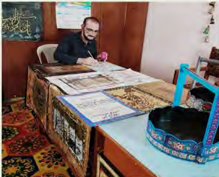
Instructor giving final touch to the Paper Machie art compiled by the students