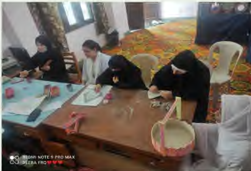
Students working in different steps of Papier Machie