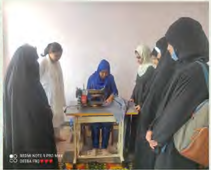
Instructor giving instructions to students how to stitch sleeves.