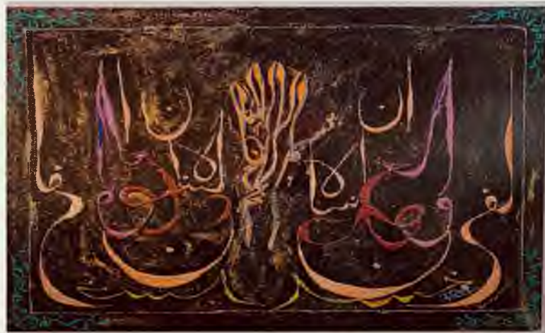
Calligraphy in Mirror art form of Papier Machie