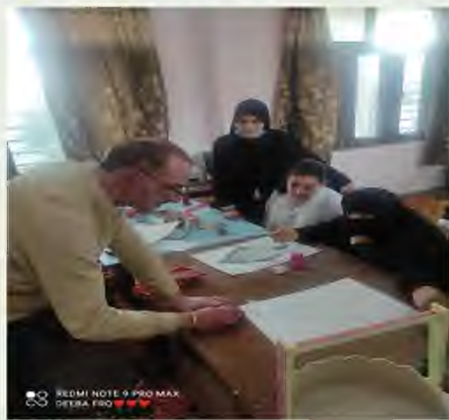
Papier Machie Training Classes