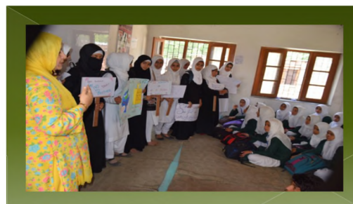
Extension lecture on Environmental Awareness