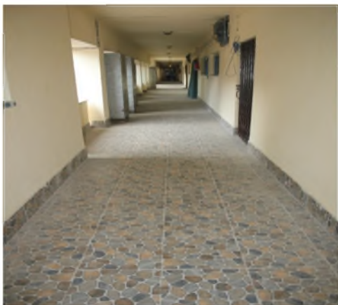
Renovation of corridor in Main Academic Block.

The college makes all efforts from time to time to bring about a constructive reform in the infrastructure in order to provide ample and adequate facilities to the students as well as the staff. In this regard, the developments in raising of physical infrastructure that took place during the period under reference are :