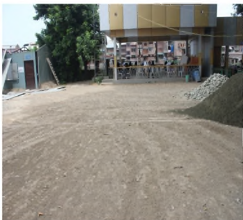
Levelling of college Ground