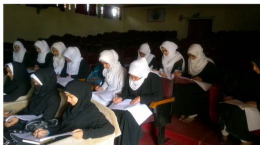
On spot essay competition .