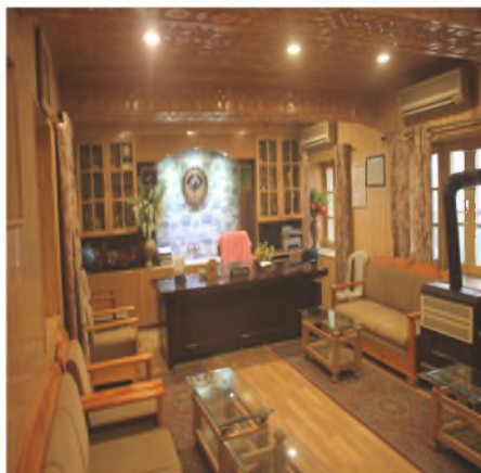
Renovation of Principal's Chamber