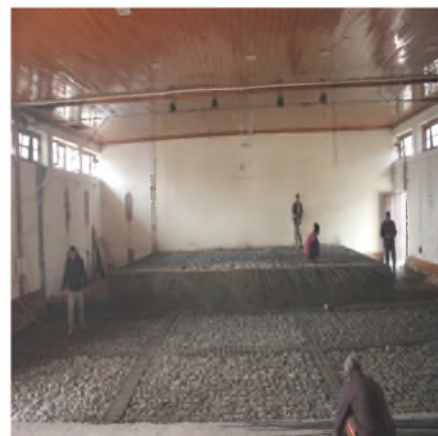
Commencement of renovation and repair works in College Auditorium.

sides these works, the college has submitted a proposal to R&B Department for establishment of car parking facility in the ground which is expected to be taken up very shortly.