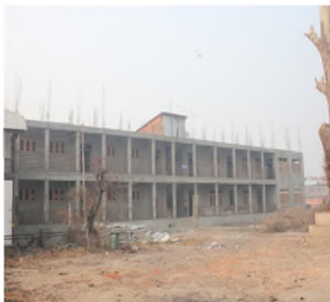
90% completion of works in New Academic Cum Science Block.