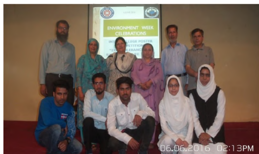
An intra-college poster competition

The NSS Wing of the college observed World Environmental Week and a series of following events were undertaken: