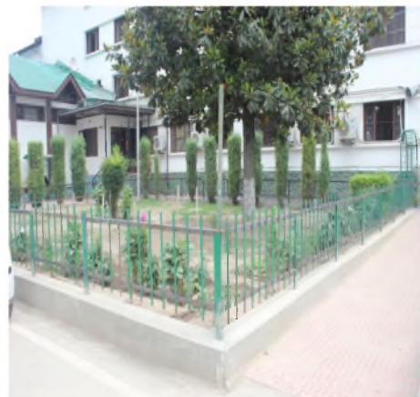
Laying of cemented blocks and iron grilling of front lawns in the campus