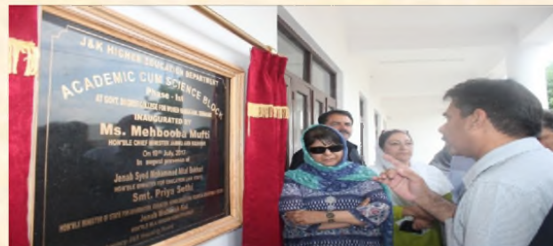
Inauguration of Ist Phase of New Academic Block