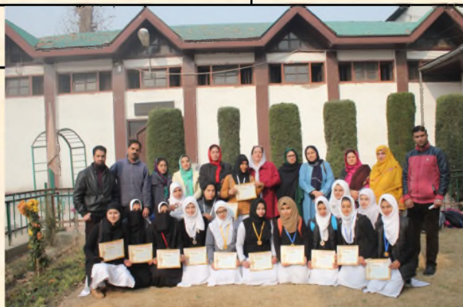
Winners of District Taekwando Championship