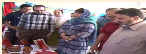
16 Dignitaries Inspecting various stalls of Skill Empowerment Cell.