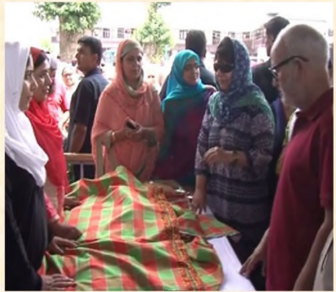
Honourable Chief Minister, Ms. Mehbooba Mufti inspecting various stalls in the exhibition