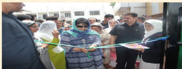
Inauguration of Badminton Hall in Heritage Building