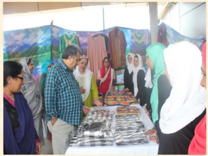
Honourable Commissioner /Secretary Department of Higher Education Dr Asgar Hassan Samoon (IAS) showing interest in different artifacts displayed in the exhibition.