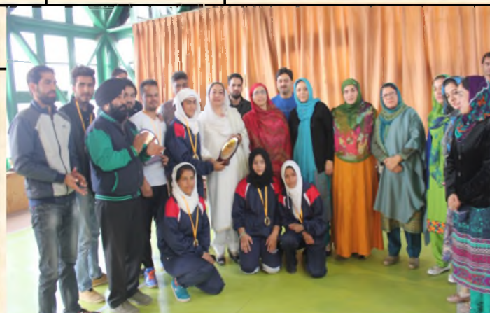
Winners of District Thang-ta Championship